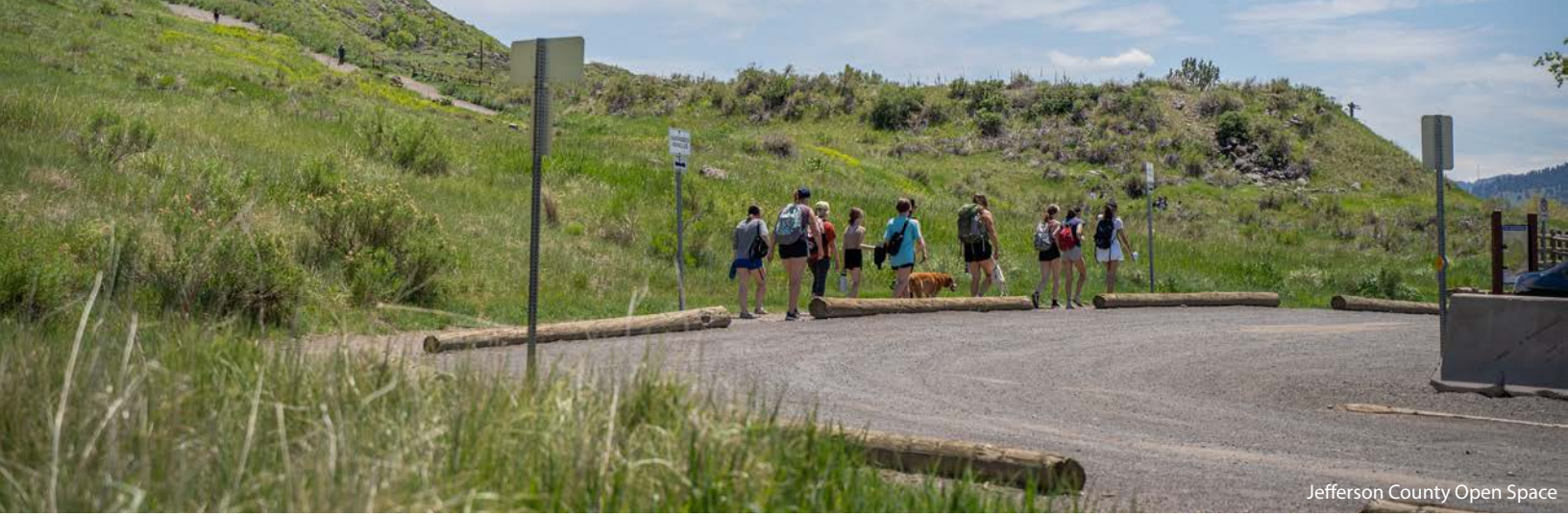
Jefferson County Open Space